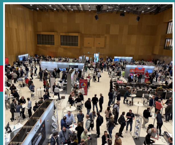
DSAG Technologietage, Wiesbaden