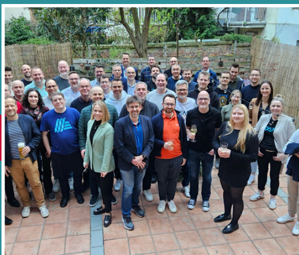
DSAG TechXChange, Wiesbaden

Designed to support evolving regulations like GDPR, AI Act, NIS2, and DORA with on-edge, AI-powered privacy tech.